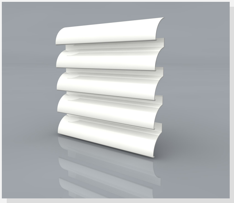
pictured: aluminum louver

FlowGrill louvers are developed for extreme circumstances and available in different designs, many functional executions and additional options.